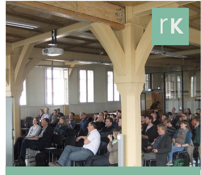
SFB 1070 ResourceCultures