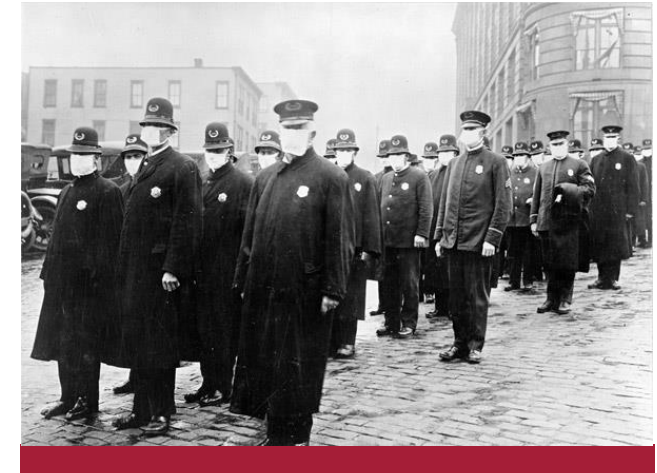
COLLABORATIVE RESEARCH CENTER 923 "THREATENED ORDER – SOCIETIES UNDER STRESS"

Please register for participation at jan.hinrichsen@uni-tuebingen.de