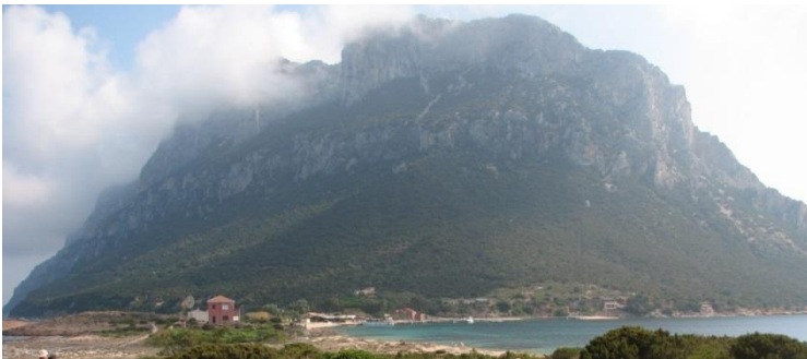
The island Tavolara