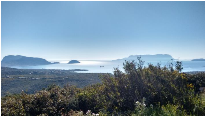
The island Tavolara, northeast of Sardinia – in the early Iron Age, islanders and mainlanders met here to exchange goods.