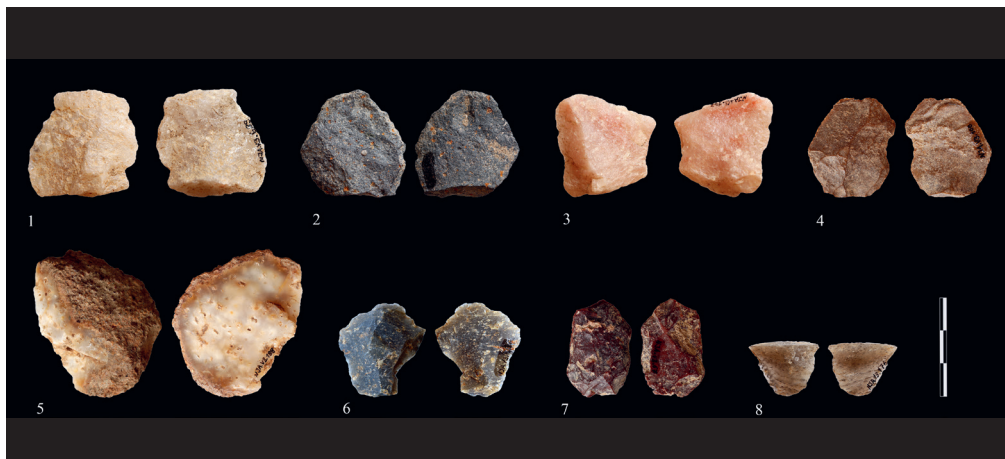
Fig. 4: Selection of different raw materials from layer III and V at Njarasa. 1) Quartz, 2) Basalt, 3) Rose quartz, 4–8) different variations of chert to be further investigated.

At the current stage, the lithic analysis of layer V and III is still in progress, but some preliminary findings are presented here. In both assemblages, most artifacts are made of hydrothermal quartz (Fig. 4.1), which is available in large quantities directly at the site in the form of large angular blocks. This raw material is also the most abundant lithic material at Mumba. Apart from this rock type we observed a large variability in different cherts (Fig. 4.4–8) and very few pieces of obsidian. Among the cherts are metasomatic sedimentary cherts from the Great Rift lakes and hydrothermal cherts formed in volcanic suites which are suitable for provenience tracing. The potential implications for our understanding of long-distance movements and territorial effects in the MSA and LSA of East Africa are obvious.