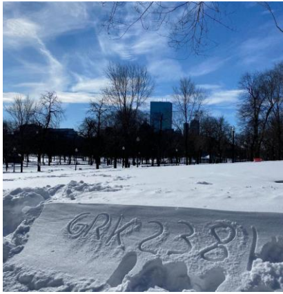
We left lasting impressions wherever we went. Be it in the Boston Common after a snow storm...