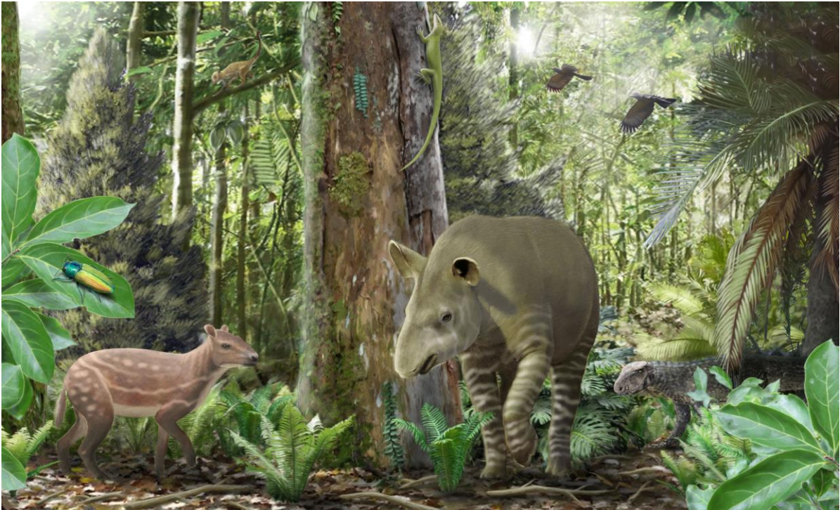
Window into the 47 million year old ecosystem of the Geiseltal fossil locality with the small-sized horse-ancestor Propalaeotherium on the left, the ancient tapir Lophiodon in the middle, and a young terrestrial crocodile Bergisuchus in the background.