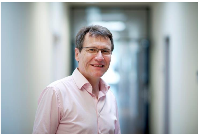
Jan Born.

“The contents of the hippocampus-independent learning were only transcribed into long-term memory when the hippocampus was active during sleep,” he summarizes. But Born says it is too soon to challenge the fifty-year old division between hippocampus-dependent and hippocampus-independent memory. “On the contrary, our study provides new insights into the division of labor between the structures in the brain. It is true that some learning and memory processes occur in their own systems. Yet we must assume that the hippocampus is a higher authority in every kind of long-term memory formation.” The researchers explain it like this: hippocampus-dependent learning is bound up with the conscious; the hippocampus is virtually always busy and fully occupied during the day when the brain is awake. “During sleep, when the conscious is switched off, the hippocampus has spare capacity and organizes the long-term formation of memories of everything learned – even of things it was not involved in creating in the first place.”