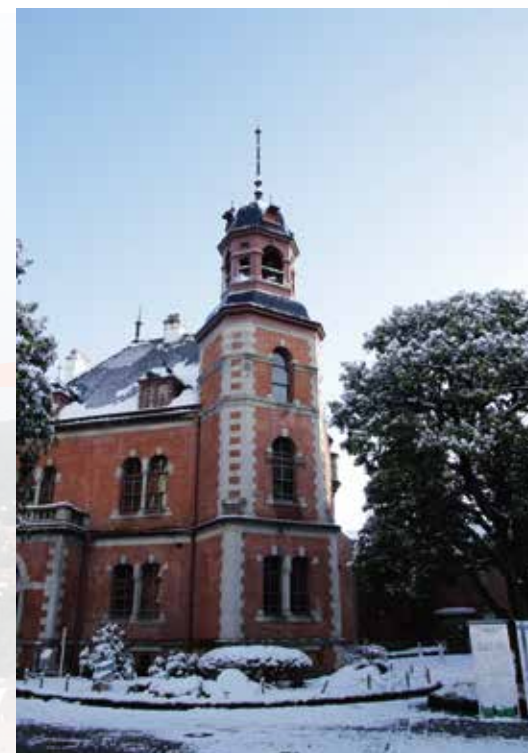
Doshisha University, Clark Memorial Hall

The 3rd International Symposium co-organized by Doshisha University and University of Tübingen will be held as below. It follows upon the first International Symposium held in 2018 at Doshisha University and the second International Symposium held in 2019 at University of Tübingen.