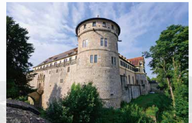
University of Tübingen, Schloss Hohentübingen