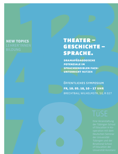
Theatre – History – Language