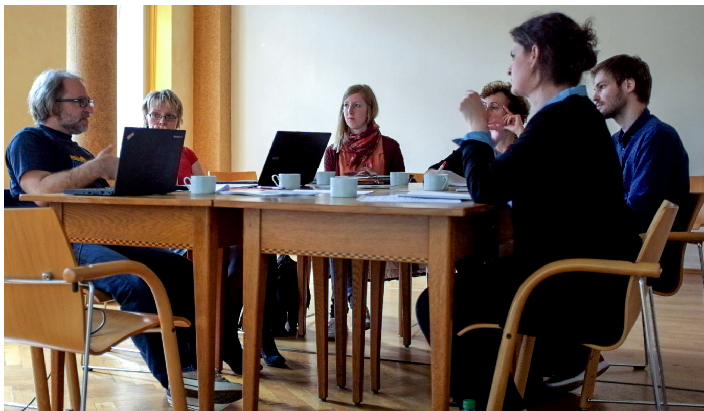
ProfiL project participants meet with the three advisors