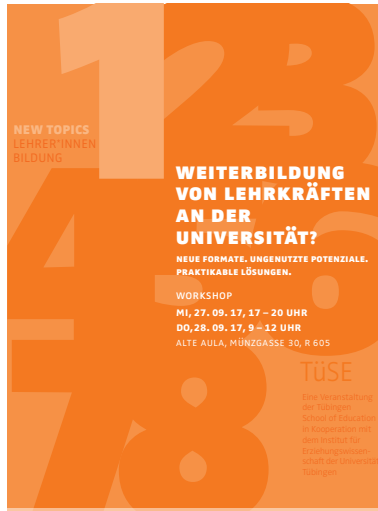
Further Education of Teachers at the University