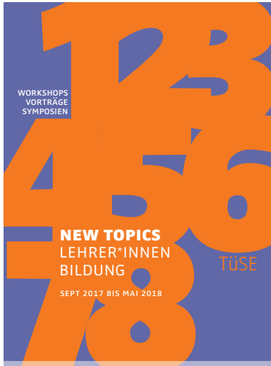
New Topics in Teacher Education