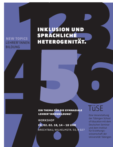
Inclusion and Linguistic Heterogeneity