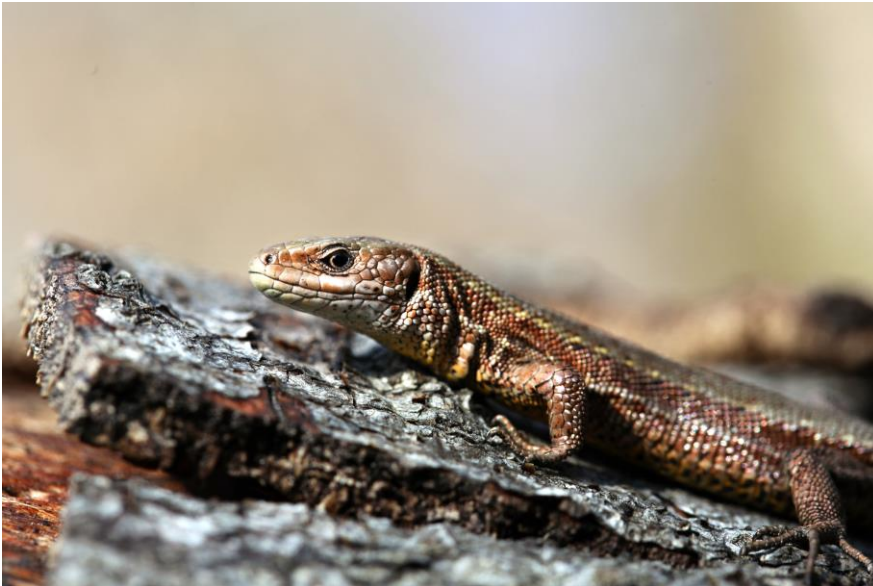
In common lizards ( Zootoca vivipara ), the male – shown here – exhibits more elaborate ornamentation than the female; the latter primarily care for the young.

Overall, the study supports the predictions of Darwin’s sexual selection theory. It also provides new starting-points for targeted investigations of how environmental and social factors can further define gender roles.