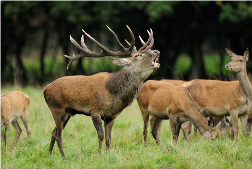
A stag with his herd.