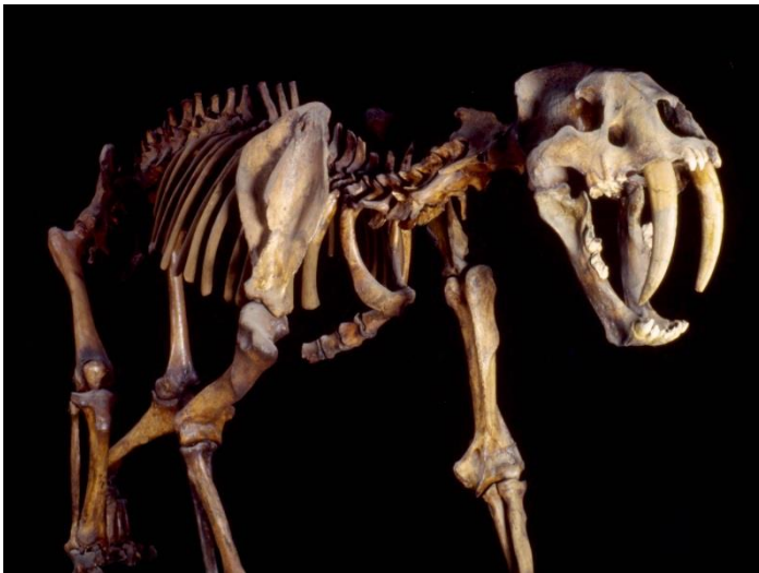
Saber-toothed cat skeleton at the Senckenberg Natural History Museum, Frankfurt