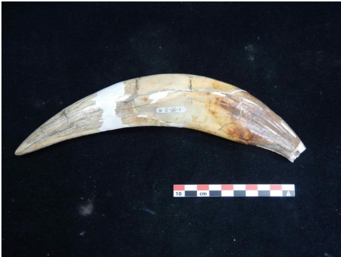
Canine tooth of a saber-toothed cat