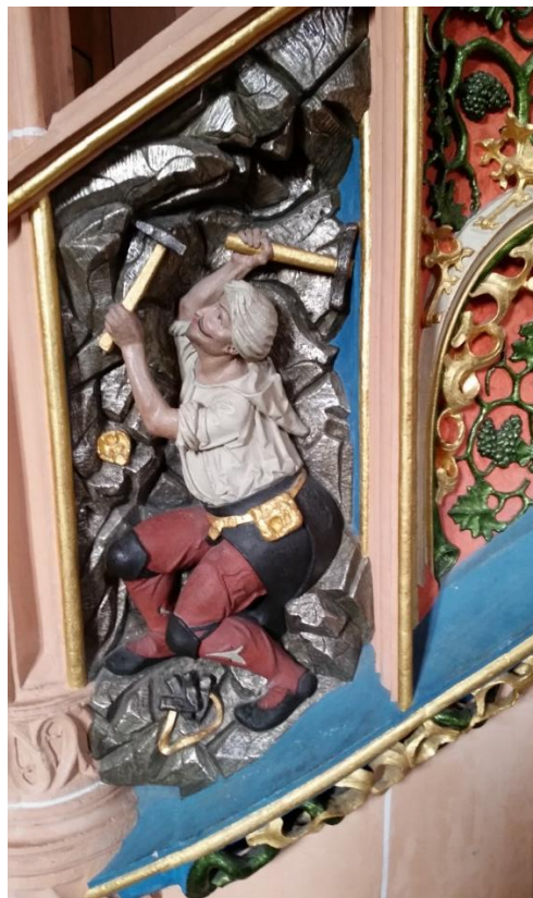
In the late Gothic Church of St. Anna in Annaberg