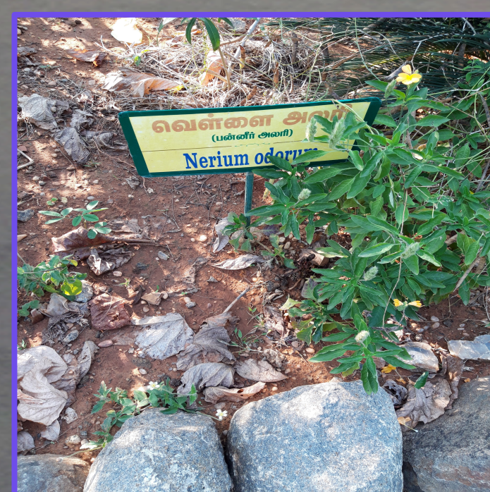
A part of a Siddha herbarium