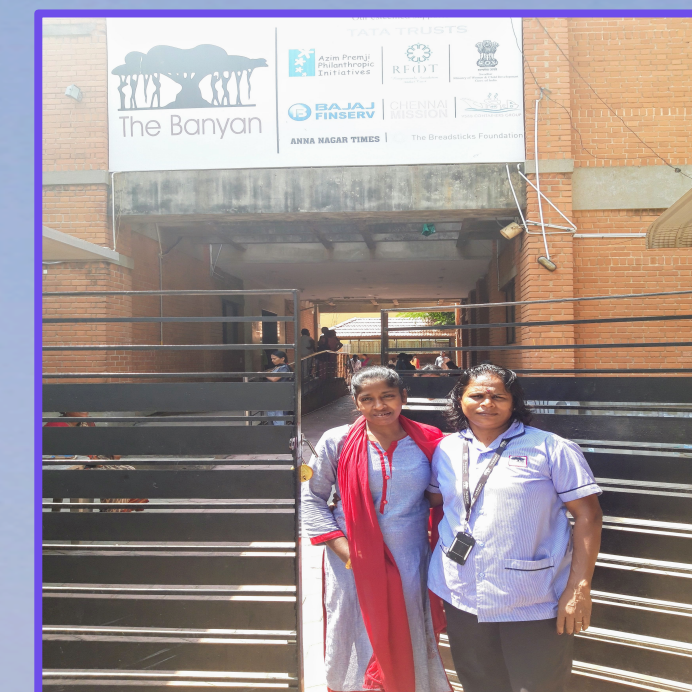
Ex-Patient guarding The Banyan