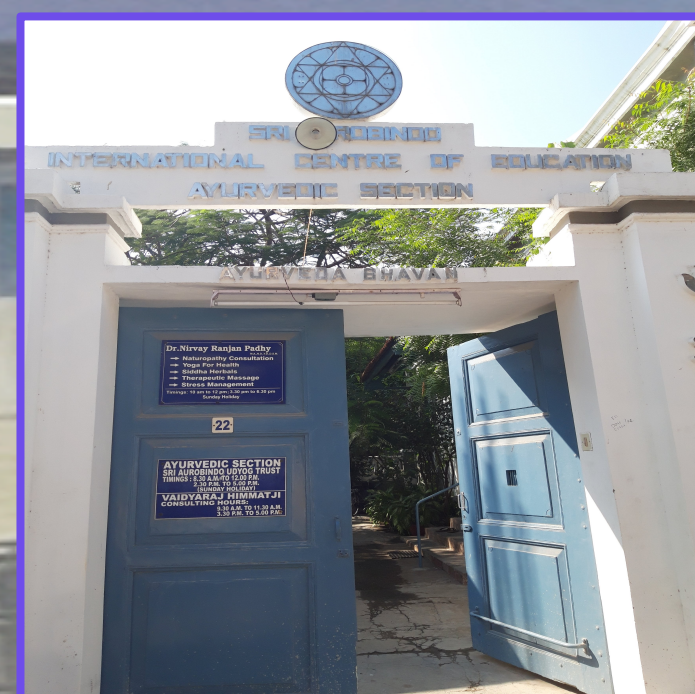
Ayurvedic section of the Sri Aurobindo Ashram, Pondicherry

During this time, I lived with a Tamil family in a small village near Auroville in the Pondicherry area. I visited various temples and ceremonies together with and without them throughout Tamil Nadu's Viluppuram district, and later volunteered at The Banyan, an NGO in Tamil Nadu's capital Chennai, which offers psychiatric care to mentally ill homeless women.