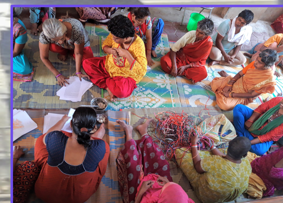
Occupational therapy at The Banyan

To find this out, I engaged in participant observation of Tamil family life, different temple healing rituals, and the day-to-day psychiatric care routine at The Banyan NGO. I also conducted structured and semi-structured interviews with a considerable variety of people: from Ayurveda and Siddha practitioners to Brahmins, traditional healers, village working women, and mental health patients and their families themselves.