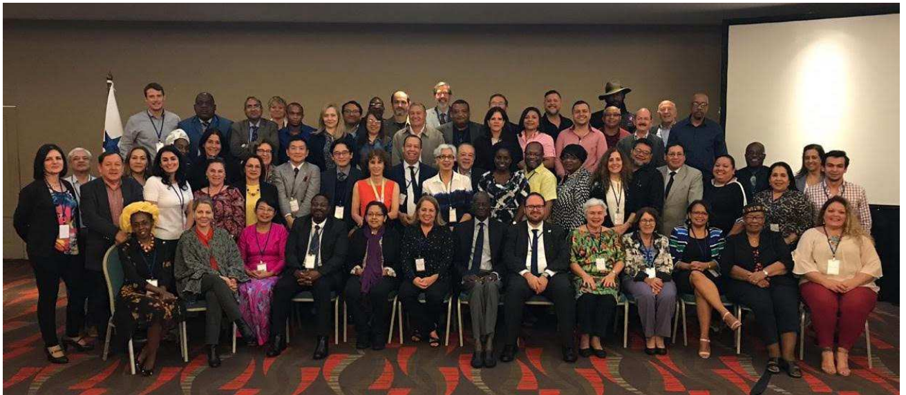
UNESCO: Memory of the World Inter Regional Conference, Panama City, 2018

The Inter-Regional Conference on Preservation and Accessibility of Documentary Heritage, organized by UNESCO in the Holiday Inn Hotel Panama City, from 24 to 27 October 2018, brought together participants from 46 countries. 10 Among them were representatives from the MoW International Advisory Committee, members from diverse National Committees around the globe, and members of the Regional Committee for Latin America and the Caribbean (MOWLAC), the African Regional Committee for Memory of the World (ARCMOW), and the Memory of the World Committee for Asia/Pacific (MOWCAP).