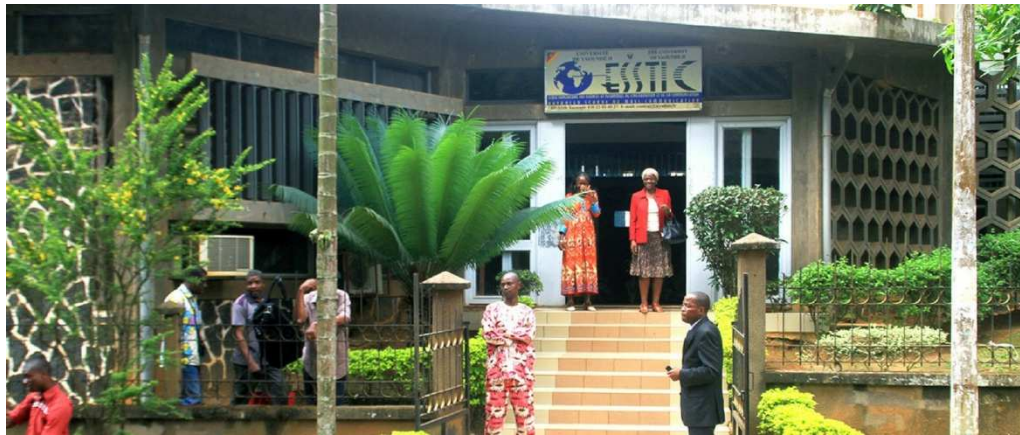
ESSTIC, Université de Yaoundé, where the Cameroon workshops were held