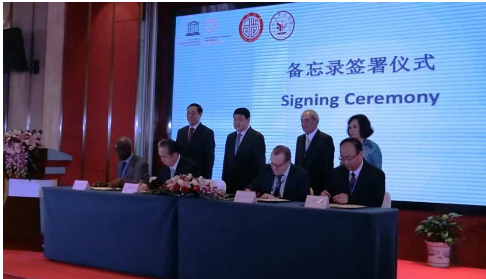
Signing of MoU