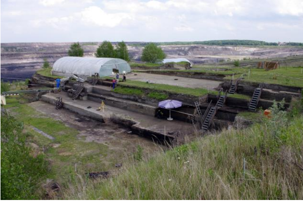
The Schöningen coal mine was once the site of a shallow lake. Evidence of human habitation along with plant and animal remains preserved there have yielded astonishing details of life here 300,000 years ago.