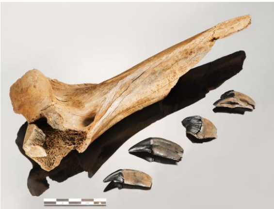
No pussycat: This big cat had saber teeth more than 10cm in length.