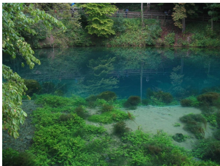
The Blautopf. The blue colour comes from Rayleigh scattering at nano-scale chalk particles in the water.

Blaubeuren is most famous for the Blautopf, Germany's second largest karstic spring. An excursion to the Blautopf was made Tuesday afternoon. It is the spring of the river Blau, a tributary river to the Danube. The Blautopf is the entrance to a widely distributed cave system under the Swabian Jura, which is partly filled with water and dewateres the surrounding higher areas.