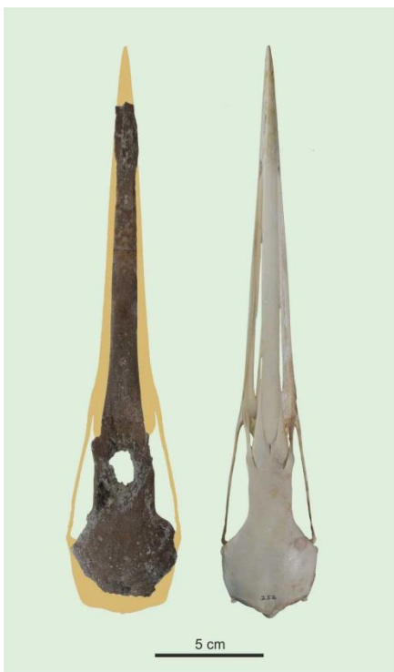
The crane skull from the Hammerschmiede fossil site (left) compared with the likewise long-beaked Siberian crane (center), which today lives in Asia.