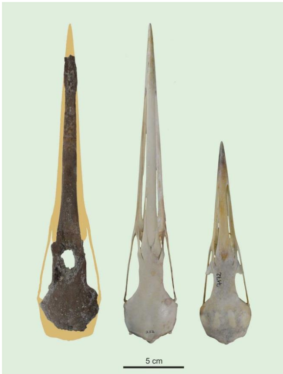
The crane skull from the Hammerschmiede fossil site (left) compared with today's Siberian crane (center) and the Eurasian crane native to Germany (right), which has a shorter beak.