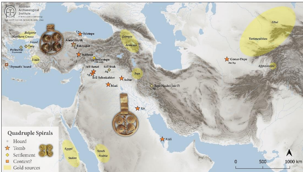
Known sites where deposits of gold were found in the Bronze Age and circulation of a striking earring with four small spirals. Abbildung aus Numrich et al. 2022; Karte: Ch. Schwall, M. Börner (ÖAI Wien)