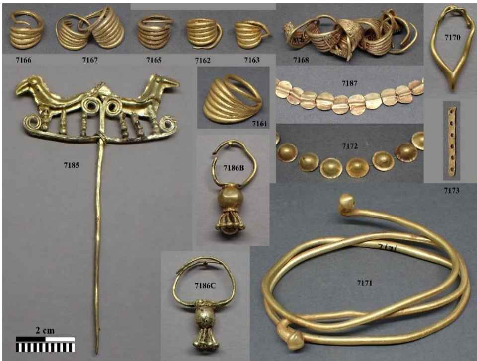
Hair ornaments (top left), a pin (bottom left), necklaces (center) and a torque (bottom right) were among the total 26 gold objects from Poliochni on Lemnos that have been studied by the international team of researchers.