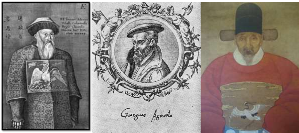
Three important historical actors discussed in this project, from left to right Johann Adam Schall von Bell, Georgius Agricola and Xu Guangqi.