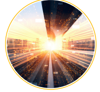
Student membership transport passes

It will also help them to get in touch with the different internal or local services of AMU.