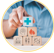
Health insurance system