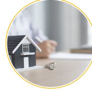
Housing and accommodation