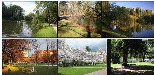
Figure 1: Images from SUN 397 [32] illustrating class ambiguity. Top: (left to right) Park, River, Pond. Bottom: Park, Campus, Picnic area.

As the number of classes increases, two important issues emerge: class overlap and multi-label nature of examples [10]. This phenomenon asks for adjustments of both the evaluation metrics as well as the loss functions employed. When a predictor is allowed k guesses and is not penalized for k - 1 mistakes, such an evaluation measure is known as top- k error. We argue that this is an important metric that will inevitably receive more attention in the future as the illustration in Figure 1 indicates.