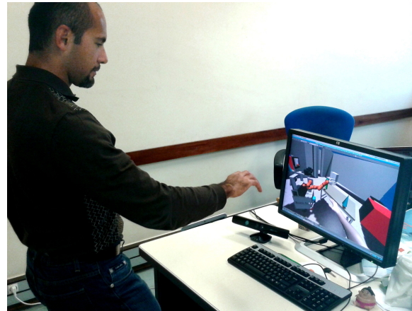
Figure 1: The experimental setup with the human avatar controlled from a Kinect.

YARP, as well as a socket-based raw protocol. This design allows in principle to use the same software in both the real robots and the simulator. Instructions given to the robot are interpreted in the simulator to provide the control of actuators, such as the motion of the robot and its arms. The data from simulated sensors is sent back through the middlewares, e.g. exporting the images from cameras, or the positions of the robot, human and other objects of interest.