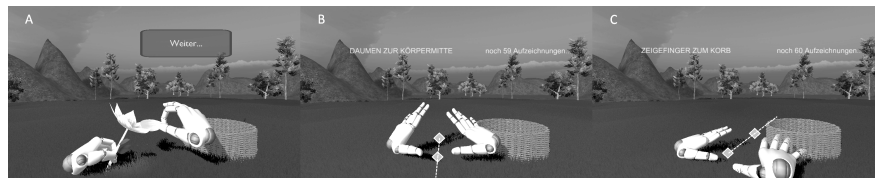
Fig. 1. Panel A: Object interaction task. Panel B: Self-Localization, diamonds indicate palm and thumb centroids, respectively. Panel C: External Localization, diamonds indicate palm and index finger centroids, respectively.

Virtual Reality Setup. Participants were equipped with an Oculus Rift © DK2 stereoscopic head-mounted display. Hand motions were captured with a Leap Motion © near-infrared sensor, placed 30cm in front of the participants on a table. The VR scenario put participants in a static mountain scenery, with a basket at the outer right corner of their reachable task space. During the experiment a flower spawned at the center of the scene and participants had to pick the petals and put them into the basket (see Fig. 1, panel A).