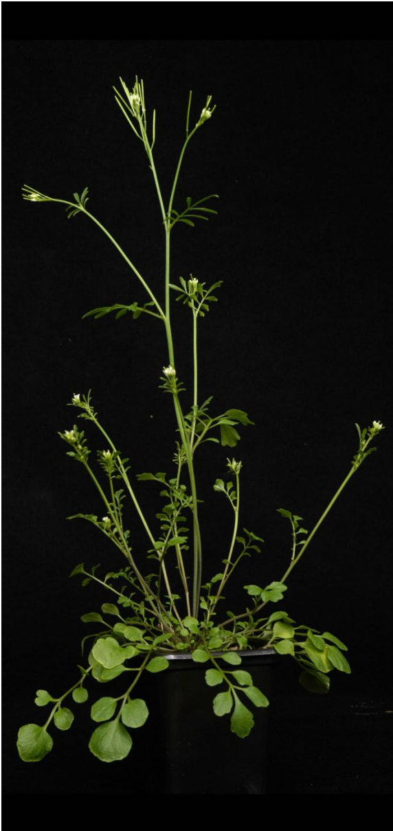
Hairy bittercress ( Cardamine hirsuta ).