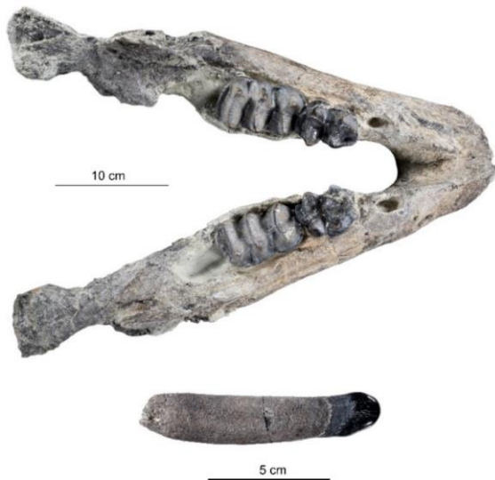
Juvenile mandible of the deinothere Deinotherium levius (above) and lower deciduous tusk (below) from Hammerschmiede.

The excavations at the Hammerschmiede were funded by the University of Tübingen, the Senckenberg Nature Research Society and the state of Bavaria.