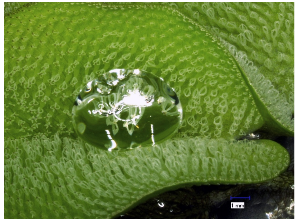
A drop of water on a leaf of the tropical floating fern Salvinia molesta .