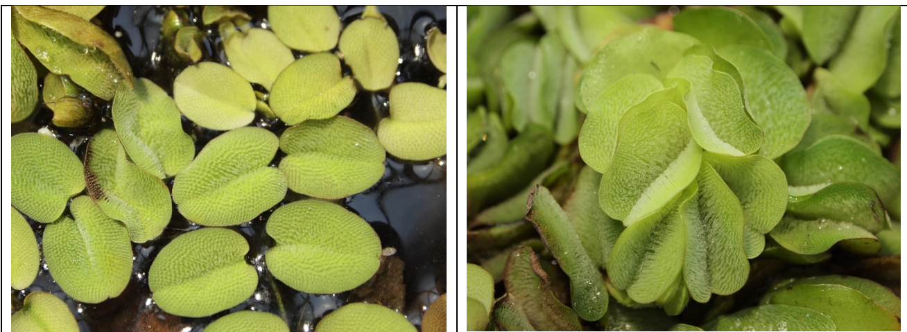
The tropical floating fern Salvinia molesta : There are water-repellent hairs, called trichomes, on the top of the leaves.

Detailed observations, however, revealed that they were very efficient at keeping the leaf base free of water. "The energy state of a droplet is more favorable on the trichomes than between them. This is due to the water-repelling effect of the whisks," Konrad explains. When a drop of water rolls over the trichomes of the leaf, it literally sucks up the residual water trapped between the trichomes due to its strong surface forces. "This keeps water off the stomata at the base of the floating fern's leaves, which are also covered with water-repellent nanocrystals made of wax. This is where the gas exchange that is vital for the plant takes place." Konrad added that this may be a decisive factor in the high productivity of the Salvinia molesta , which can double its leaf mass within a few days under favorable conditions.