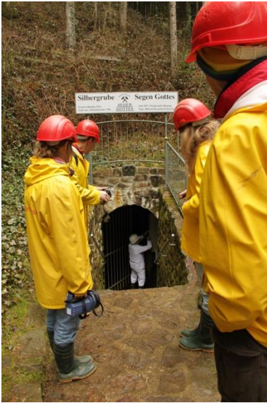
Entrance to silver mine "Segen Gottes" (SW Germany, Black forest).