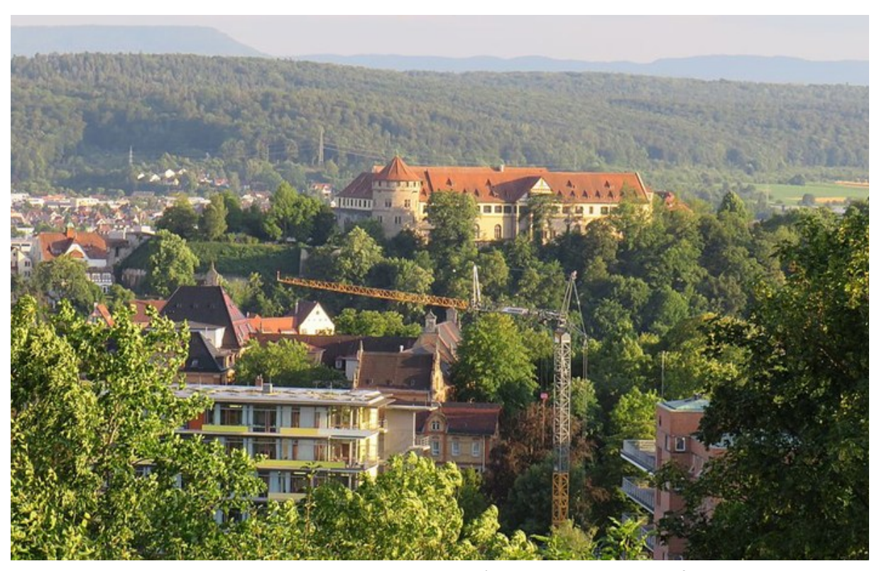
From your accommodation and workshop location, you'll enjoy a direct view of Tübingen Castle, the historic old town, and the Alb mountains in the background

The ERCCT will hold its fourth Taiwan Europe Connectivity Workshop, a workshop for emerging young scholars, i.e. Ph.D. students (3rd year and above) and postdocs, from 29 June to 5 July, 2025. The main topic for this year's workshop is "The state of affairs in cross-strait relations: taking stock and looking ahead". Other paper submissions pertaining to the fields of Taiwan politics, society, economics and cross-strait relations and related topics are highly welcome.