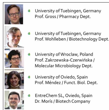
Fig. 2 The European NeBrasCa Team such as antibody-based drugs, have a faster onset of action and exhibit a higher specificity than the existing small molecule-based therapies but they can also cause severe side effects such as the development of idiopathic thrombocytopenic purpura, progressive multifocal leucoencephalopathy, and lupus-like syndromes or vasculitis.

A further specific small molecule represents the inosine monophosphate dehydrogenase-inhibitor mycophenolate mofetil. It causes adverse events, such as anaemia, teratogenicity and an increased risk of opportunistic infections, such as activation of latent viral infections (e.g. herpes virus, cytomegalovirus and BK virus). Biologicals,