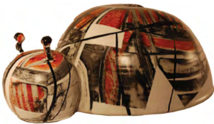
José Lazcarro Toquero, Catarina Lazcarroza , 2010, mixed media on clay, 20 x 47 x 35 cm. UDLAP's Art Collection.