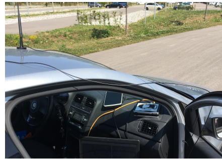
Figure 2: Vehicular unit hardware on the field test.

The vehicle sends out NFN requests for a computation intensive operation during the journey (e.g., augmentation of a map). An RSU overhearing the request starts the computation following the FaX strategy, while the car moves out of the communication range of the RSU. As soon as the car connects to the next RSU, it send out the NFN request again. Based on the FaX strategy, the second RSU starts the computation and searches for a cached result in the network. Since the previous RSU has already finished the computation in the meantime, the result can be directly transported to the second RSU. Finally, the result can be directly shipped to the car. While the FaX strategy results in occupying more computational resources at the edge compared to the default FoX strategy, FaX has shown improvements in timely data delivery in mobile scenarios. The