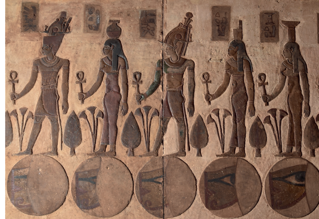
Ceiling ('Travée A'), moon phases, detail.