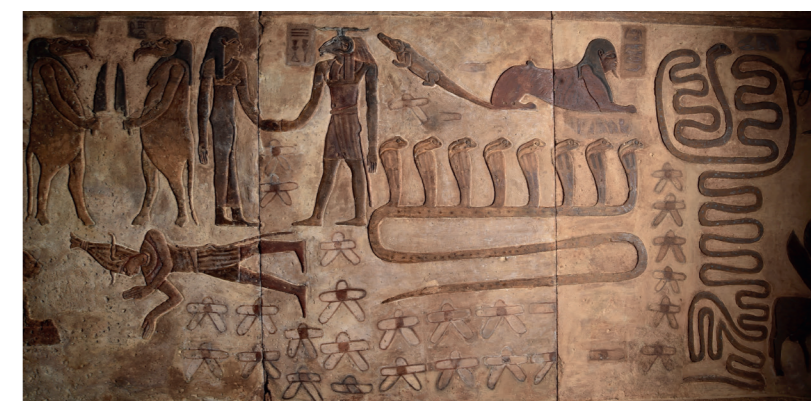
Ceiling ('Travée A'), constellations, detail.

Turning to the columns, the cleaning and conservation of the northern columns has steadily progressed in recent months. Of