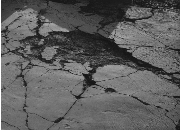
Photo by: Eric Asamoah: The Day After Tomorrow (Copyright © Eric Asamoah, 2021)

3 May (Wednesday): 2 pm - 8 pm, Brechtbau, room 215 4 May (Thursday): 6 pm - 8 pm, Neue Aula, Großer Senat