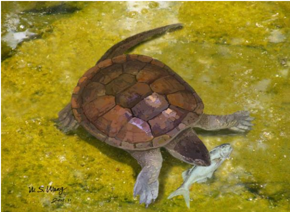
Reconstruction of Xiaochelys ningchengensis in its freshwater environment, preying on a small fish found in the same layer as the turtle, called Lycoptera . Illustration: W. S. Wang.

Genealogical tree of the chelonia, as the recent study outlines it. The Jehol species more probably represent ancient hidden-neck turtles than primitive sea turtles but the difference in the statistical support between these hypotheses is small. Image: Chang-Fu Zhou and Márton Rabi.