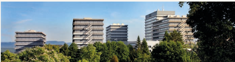
University of Tübingen Sciences Campus